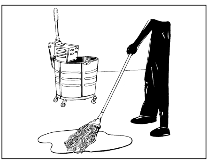
Figure 2. Applying the Statguard® Low Residue Floor Stripper with a cotton mop