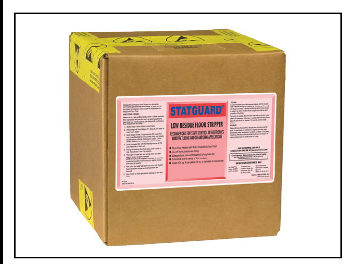
Figure 1. Statguard® Low Residue Floor Stripper